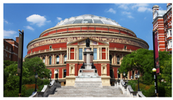
Royal Albert Hall