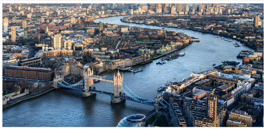
City of London

A city is a large urban settlement where lots of people live and work. There are many shops, restaurants, museums and theatres.