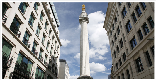
Monument to the Great Fire of London

The Great Fire of London was a significant event in London's history. It began in a bakery on Pudding Lane on Sunday 2nd September 1666. Many buildings were destroyed, including St Paul's Cathedral. Today, a monument stands near the place where the fire began.