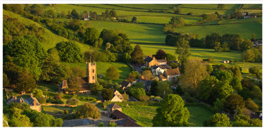
Village of Corton Denham, Somerset

The countryside is a rural area outside of a town or city. Less people live and work in the countryside than in a city.