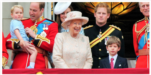
HM Queen Elizabeth II

Queen Elizabeth II is the current monarch of the United Kingdom. She was born in 1926 and became queen in 1952. The Queen is famous across the world.